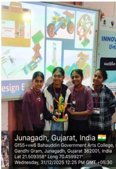
Junagadh, Gujarat, India 🇮🇳 Gf55+vw6 Bahauddin Government Arts College, Gandhi Gram, Junagadh, Gujarat 362001, India Lat 21.509358° Long 70.459921° Wednesday, 31/12/2025 12:25 PM GMT +05:30