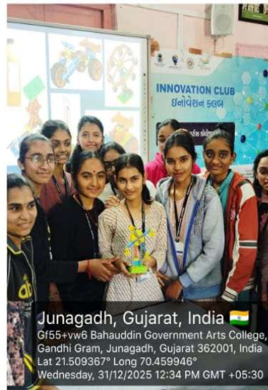
Junagadh, Gujarat, India 🇮🇳 Gf55+vw6 Bahauddin Government Arts College, Gandhi Gram, Junagadh, Gujarat 362001, India Lat 21.509367° Long 70.459946° Wednesday, 31/12/2025 12:34 PM GMT +05:30