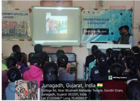
Junagadh, Gujarat, India College Rd, Near Bhutnath Mahadev Temple, Gandhi Gram, Junagadh, Gujarat 362001, India Lat 21.509467° Long 70.459953°