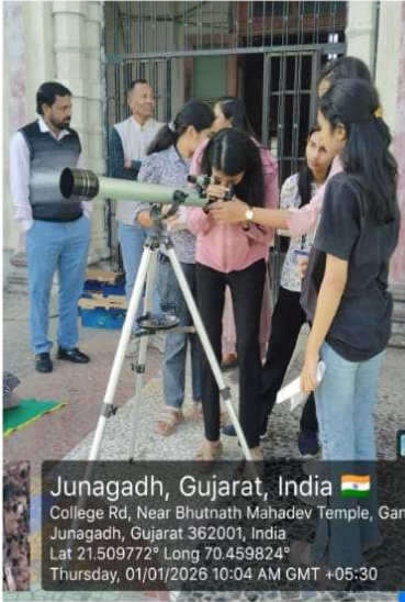
Junagadh, Gujarat, India 🇮🇳 College Rd, Near Bhutnath Mahadev Temple, Gan Junagadh, Gujarat 362001, India Lat 21.509772° Long 70.459824° Thursday, 01/01/2026 10:04 AM GMT +05:30