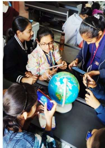
Junagadh, Gujarat, India 🇮🇳 Gf55+vw6 Bahauddin Government Arts College, Gandhi Gram, Junagadh, Gujarat 362001, India Lat 21.509369° Long 70.459922° Tuesday, 30/12/2025 12:28 PM GMT +05:30