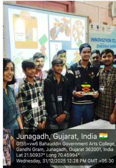
Junagadh, Gujarat, India 🇮🇳 Gf55+vw6 Bahauddin Government Arts College, Gandhi Gram, Junagadh, Gujarat 362001, India Lat 21.50937° Long 70.45994° Wednesday, 31/12/2025 12:28 PM GMT +05:30