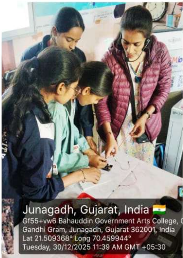
Junagadh, Gujarat, India 🇮🇳 Gf55+vw6 Bahauddin Government Arts College, Gandhi Gram, Junagadh, Gujarat 362001, India Lat 21.509368° Long 70.459944° Tuesday, 30/12/2025 11:39 AM GMT +05:30