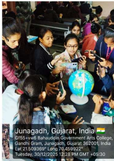
Junagadh, Gujarat, India 🇮🇳 Gf55+vw6 Bahauddin Government Arts College, Gandhi Gram, Junagadh, Gujarat 362001, India Lat 21.509369° Long 70.459922° Tuesday, 30/12/2025 12:28 PM GMT +05:30