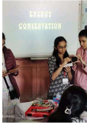
Junagadh, Gujarat, India 🇮🇳 Gf55+vw6 Bahauddin Government Arts College, Gandhi Gram, Junagadh, Gujarat 362001, India Lat 21.509425° Long 70.459962° Tuesday, 30/12/2025 09:41 AM GMT +05:30