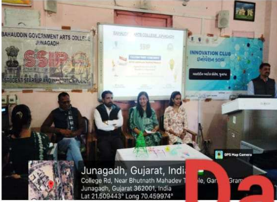
Junagadh, Gujarat, India College Rd, Near Bhutnath Mahadev Temple, Gandhi Gram, Junagadh, Gujarat 362001, India Lat 21.509443° Long 70.459974°