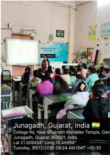
Junagadh, Gujarat, India 🇮🇳 College Rd, Near Bhutnath Mahadev Temple, Gandhi Gram, Junagadh, Gujarat 362001, India Lat 21.509454° Long 70.45994° Tuesday, 30/12/2025 09:24 AM GMT +05:30