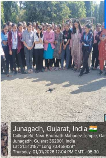
Junagadh, Gujarat, India 🇮🇳 College Rd, Near Bhutnath Mahadev Temple, Gan Junagadh, Gujarat 362001, India Lat 21.510187° Long 70.459829° Thursday, 01/01/2026 12:04 PM GMT +05:30