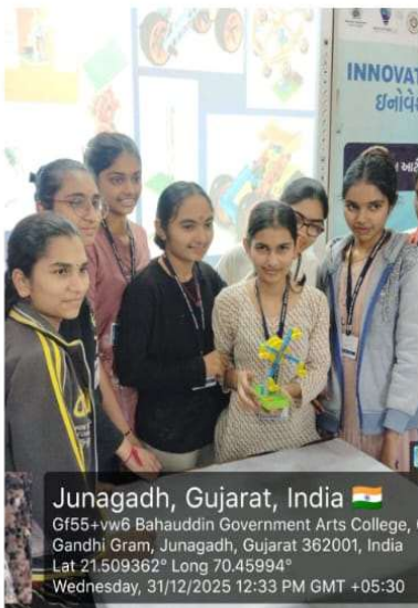
Junagadh, Gujarat, India 🇮🇳 Gf55+vw6 Bahauddin Government Arts College, Gandhi Gram, Junagadh, Gujarat 362001, India Lat 21.509362° Long 70.45994° Wednesday, 31/12/2025 12:33 PM GMT +05:30