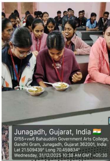
Junagadh, Gujarat, India 🇮🇳 Gf55+vw6 Bahauddin Government Arts College, Gandhi Gram, Junagadh, Gujarat 362001, India Lat 21.509439° Long 70.459834° Wednesday, 31/12/2025 10:38 AM GMT +05:30