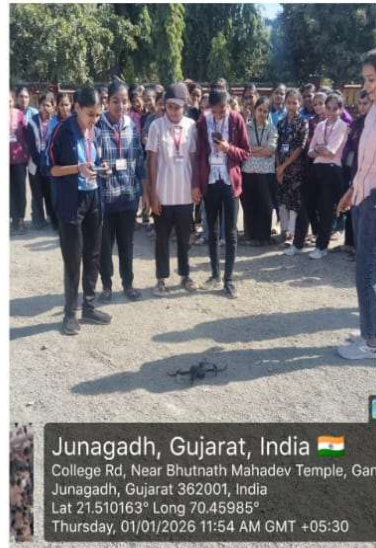
Junagadh, Gujarat, India 🇮🇳 College Rd, Near Bhutnath Mahadev Temple, Gan Junagadh, Gujarat 362001, India Lat 21.510163° Long 70.45985° Thursday, 01/01/2026 11:54 AM GMT +05:30