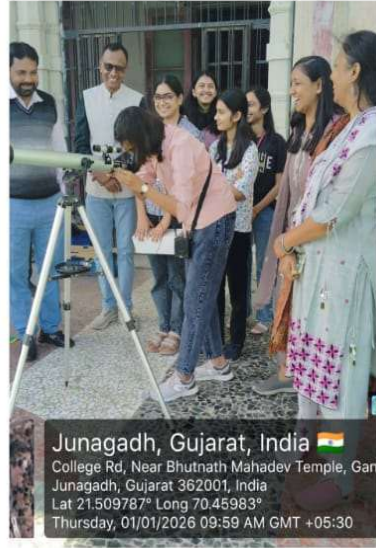
Junagadh, Gujarat, India 🇮🇳 College Rd, Near Bhutnath Mahadev Temple, Gan Junagadh, Gujarat 362001, India Lat 21.509787° Long 70.45983° Thursday, 01/01/2026 09:59 AM GMT +05:30