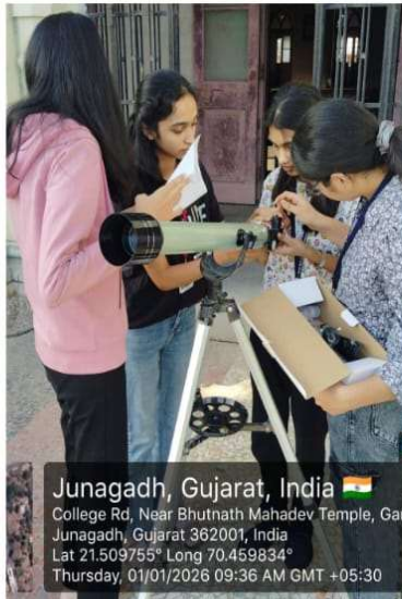
Junagadh, Gujarat, India 🇮🇳 College Rd, Near Bhutnath Mahadev Temple, Gan Junagadh, Gujarat 362001, India Lat 21.509755° Long 70.459834° Thursday, 01/01/2026 09:36 AM GMT +05:30