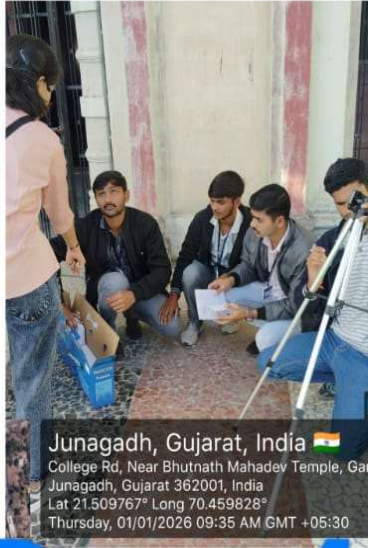
Junagadh, Gujarat, India 🇮🇳 College Rd, Near Bhutnath Mahadev Temple, Gan Junagadh, Gujarat 362001, India Lat 21.509767° Long 70.459828° Thursday, 01/01/2026 09:35 AM GMT +05:30