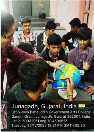
Junagadh, Gujarat, India 🇮🇳 Gf55+vw6 Bahauddin Government Arts College, Gandhi Gram, Junagadh, Gujarat 362001, India Lat 21.509329° Long 70.459966° Tuesday, 30/12/2025 12:21 PM GMT +05:30