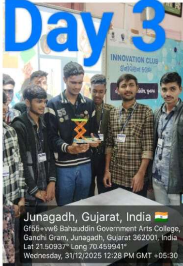
Junagadh, Gujarat, India 🇮🇳 Gf55+vw6 Bahauddin Government Arts College, Gandhi Gram, Junagadh, Gujarat 362001, India Lat 21.50937° Long 70.459941° Wednesday, 31/12/2025 12:28 PM GMT +05:30