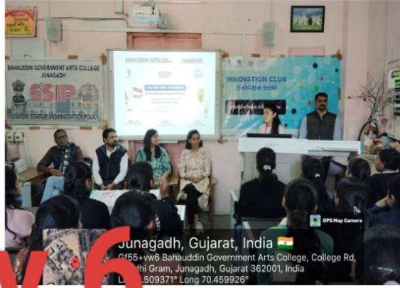
Junagadh, Gujarat, India G155+vw6 Bahauddin Government Arts College, College Rd, Gandhi Gram, Junagadh, Gujarat 362001, India Lat 21.509371° Long 70.459926°