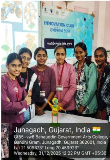
Junagadh, Gujarat, India 🇮🇳 Gf55+vw6 Bahauddin Government Arts College, Gandhi Gram, Junagadh, Gujarat 362001, India Lat 21.509373° Long 70.459923° Wednesday, 31/12/2025 12:22 PM GMT +05:30