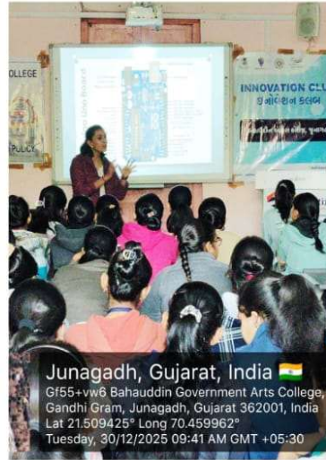
Junagadh, Gujarat, India 🇮🇳 Gf55+vw6 Bahauddin Government Arts College, Gandhi Gram, Junagadh, Gujarat 362001, India Lat 21.509425° Long 70.459962° Tuesday, 30/12/2025 09:41 AM GMT +05:30