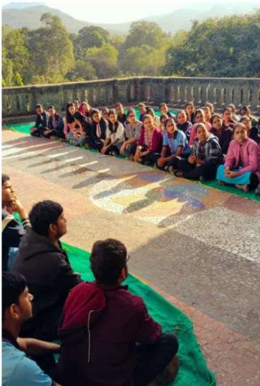
Junagadh, Gujarat, India 🇮🇳 College Rd, Near Bhutnath Mahadev Temple, Gan Junagadh, Gujarat 362001, India Lat 21.509755° Long 70.459834° Thursday, 01/01/2026 09:36 AM GMT +05:30