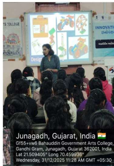
Junagadh, Gujarat, India 🇮🇳 Gf55+vw6 Bahauddin Government Arts College, Gandhi Gram, Junagadh, Gujarat 362001, India Lat 21.509405° Long 70.459936° Wednesday, 31/12/2025 11:28 AM GMT +05:30