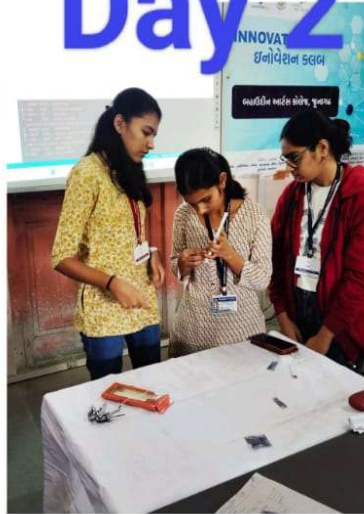
Junagadh, Gujarat, India 🇮🇳 Gf55+vw6 Bahauddin Government Arts College, Gandhi Gram, Junagadh, Gujarat 362001, India Lat 21.509369° Long 70.459922° Tuesday, 30/12/2025 12:28 PM GMT +05:30