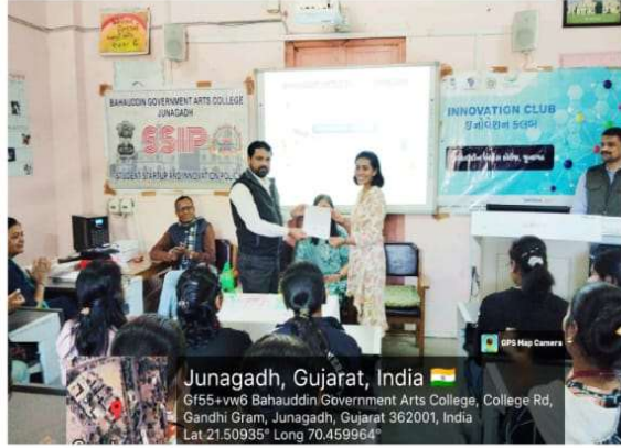
Junagadh, Gujarat, India G155+vw6 Bahauddin Government Arts College, College Rd, Gandhi Gram, Junagadh, Gujarat 362001, India Lat 21.50935° Long 70.459964°