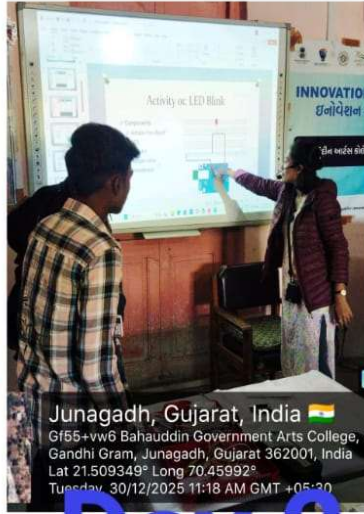
Junagadh, Gujarat, India 🇮🇳 Gf55+vw6 Bahauddin Government Arts College, Gandhi Gram, Junagadh, Gujarat 362001, India Lat 21.509349° Long 70.45992° Tuesday, 30/12/2025 11:18 AM GMT +05:30