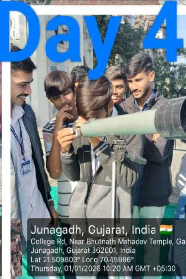
Junagadh, Gujarat, India 🇮🇳 College Rd, Near Bhutnath Mahadev Temple, Gan Junagadh, Gujarat 362001, India Lat 21.509803° Long 70.45986° Thursday, 01/01/2026 10:20 AM GMT +05:30