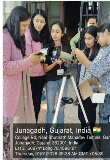
Junagadh, Gujarat, India 🇮🇳 College Rd, Near Bhutnath Mahadev Temple, Gan Junagadh, Gujarat 362001, India Lat 21.50974° Long 70.459816° Thursday, 01/01/2026 09:38 AM GMT +05:30