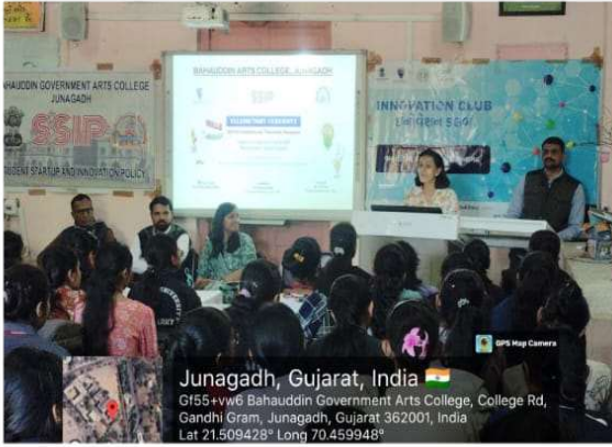
Junagadh, Gujarat, India G155+vw6 Bahauddin Government Arts College, College Rd, Gandhi Gram, Junagadh, Gujarat 362001, India Lat 21.509428° Long 70.459948°